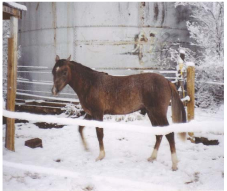
My orphaned colt, living just below my cottage on the side of a mountain. I prepared buckets of warm tea every evening during the winter to support his good health and prepare him for the cold night.